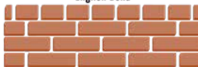
English Garden Wall Bond