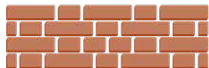
Flemish Cross Bond